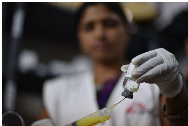
Figure 1 Nurse preparing liposomal amphotericin B. Date taken: 11 July 2015. Location: Bihar, India.

of AmBisome for other usages and markets often exceeds US$200 per vial. The recent outbreak of COVID-19-related mucormycosis in India has significantly increased global demand for L-AmB. Half of the doses of AmBisome donated to India for visceral leishmaniasis have already been diverted to respond to the urgent needs for mucormycosis. 9 The few generic manufacturers of L-AmB in India and Taiwan have struggled to provide L-AmB in sufficient quantities. 10 Additionally, since these generic sources are not prequalified by the WHO, this represents a barrier to the procurement and use by international organisations including Médecins Sans Frontières. Meanwhile, Gilead's new manufacturing plant for AmBisome has been repurposed to produce remdesivir for COVID-19, which has debatable clinical effectiveness. The supply capacity of AmBisome is now clearly insufficient to meet all needs for the drug.